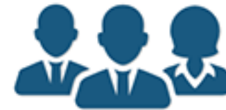
Marketing Ideas & Support