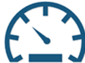
Web Marketing Dashboard